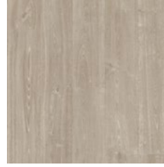
Sun Bleached Oak 3384 plank size in sheet: 200 x 1500mm w/r 3372 LRV 31