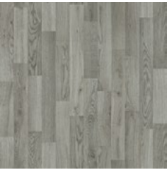
Silver Oak 3352 plank size in sheet: 83 x 333/666mm w/r 3237 LRV 23