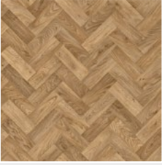
Eton Oak Parquet 3399 plank size in sheet: 76.2 x 288.6mm w/r 9822 LRV 24