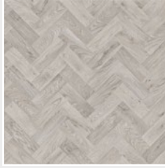
Parish Oak Parquet 3398 plank size in sheet: 76.2 x 288.6mm w/r 9841 LRV 32