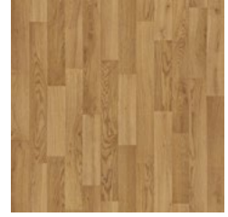
Rustic Oak 3332 plank size in sheet: 83 x 333/666mm w/r 3330 LRV 26