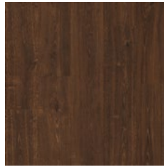
Aged Oak 3389 plank size in sheet: 200 x 1500mm w/r 9824 LRV 9