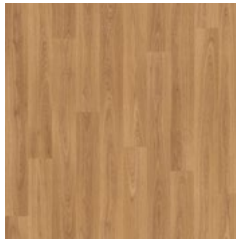
European Oak 3342 plank size in sheet: 100 x 1000mm w/r 3340 LRV 23